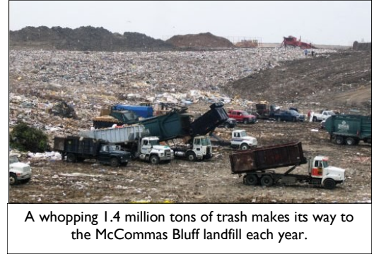
A whopping 1.4 million tons of trash makes its way to the McCommas Bluff landfill each year.

Dallas recently converted to WasteWORKS-SQL and has noticed several improvements in the processing of transactions. “One noticeable difference has been the improved processing times at the automated scales. McCommas Bluff customers are able to quickly process their transactions at the WasteWIZARD scale. Most are processed and on their way in under a minute”, according to Saucier. With the addition of two new automated scales scheduled to open in early 2012, customers visiting McCommas Bluff Landfill should be able to enter and exit faster than ever before—streamlining an already efficient operation. Saucier also notes, “the SQL application has also drastically improved the time it takes for billing and creating reports. The accounting staff has been very happy with the shorter processing time”. The city utilizes a range of reporting tools, including WasteWORKS stock reports and custom reports generated from Crystal Reports and MS Reporting Services.