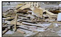
Abbey Green takes construction debris like this and turns it into numerous, valuable commodities.

The Abbey Green facility is permitted as a transfer, recycling, resource recovery, and processing facility, on a site conveniently located five minutes south of downtown Winston-Salem directly off US Highway 52. The company is permitted to receive 425 tons per day of construction and demolition debris as well as industrial debris that meets their permit. The acceptable debris list consists of wood (including pallets), aggregates and soil, drywall, roofing, metals, white goods, plastics, cardboard and paper, carpet and padding. Abbey Green also runs a small LCID landfill.