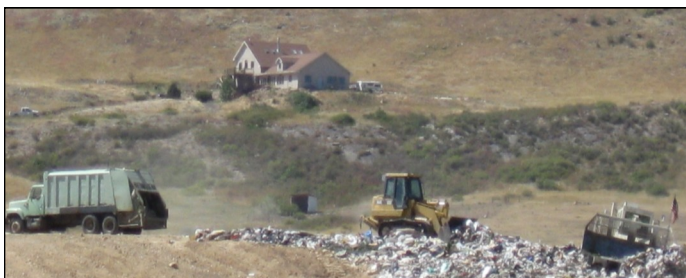
Larimer County proves that a landfill can be a good neighbor.

The Larimer County Landfill is unlined but was grandfathered in when landfills were required to be lined. Water (leachate) and methane wells on site are monitored regularly to prevent air and ground water contamination. Due to a semi-arid environment and good management practices, collection of methane for energy has not yet met the level feasible for energy production.