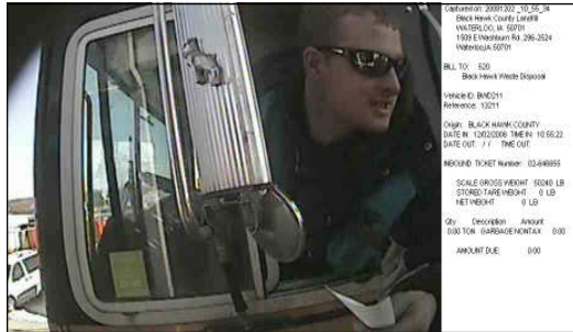
A driver's image, captured by the camera in one of Black Hawk County Landfill's four new WasteWIZARD automation systems.

I have been associated with Carolina Software for nearly 10 years and had installed WasteWORKS at