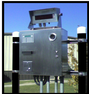
New, dual WasteWIZARD systems on a new, third scale help Escambia County efficiently handle traffic from both left and right side drivers!

such an efficient and environmentally sound job handling the nearly 300,000 tons of waste