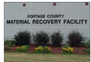
The Portage County MRF Provides a full service recyclables center and education center for county residents.

The Solid Waste Department also operates a MRF