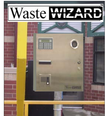
The NEW WasteWIZARD

Carolina Software introduces the latest in scale lane automation technology. The recently re-designed WasteWIZARD system now features an industrial, stainless steel enclosure, a professionally developed electrical and wiring system, and an integrated camera system for use with the WasteWORKS Vision System. The new WasteWIZARD system is the perfect automated addition for WasteWORKS sites, and a great upgrade for existing WasteWIZARD installations. Call today for information about adding the NEW WasteWIZARD to your site!