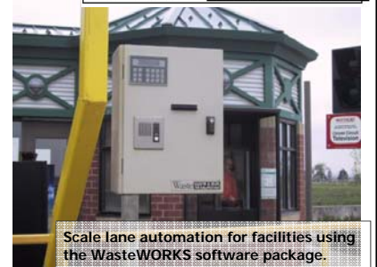
Scale lane automation for facilities using the WasteWORKS software package.