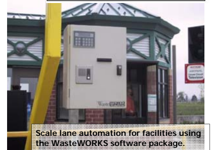
Scale lane automation for facilities using the WasteWORKS software package.