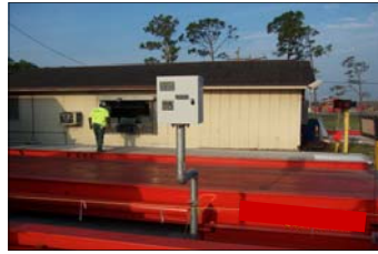
The addition of WasteWIZARD has added speed and efficiency to this very busy scale house!.

In the ongoing struggle to keep up with the expanding waste stream generated by the expanding populations, the county has recently completed a few updates at the scale facility. This face lift included the replacement of older scales and the addition of a new scale. In an effort to make the most efficient