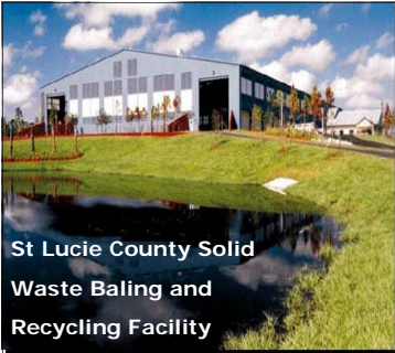
St Lucie County Solid Waste Baling and Recycling Facility

The St. Lucie County Solid Waste and Recycling Facility could be considered a model facility for solid waste disposal, but that would be an understatement. Boasting an award winning gas to energy system and a construction debris processing facility, this site prides itself on producing useful resources from its incoming waste and construction debris,