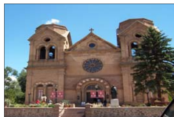
One of the few historic structures in Santa Fe that is actually of French design, the St. Francis Cathedral is still a stunning sight and probably the most photographed building in town.

The first European settlers came to the area in 1607 and established their capital in the place that later became Santa Fe. Aside from a few changes of ownership—Spain, Mexico and eventually seized by the United States—this settlement and regional capital has persisted, making it the second oldest in the United States.