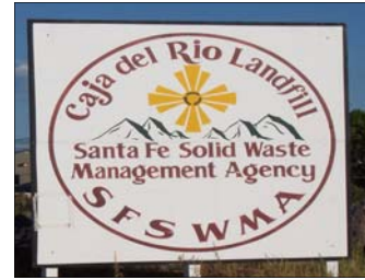
The Caja del Rio Landfill, named for the Caja del Rio Plateau, boxes in and contains the Rio Grande River. This area is a hot spot for outdoor activity, especially for those folks with off-road vehicles.

around the country, dust is just a part of the package, but with just over 12 inches